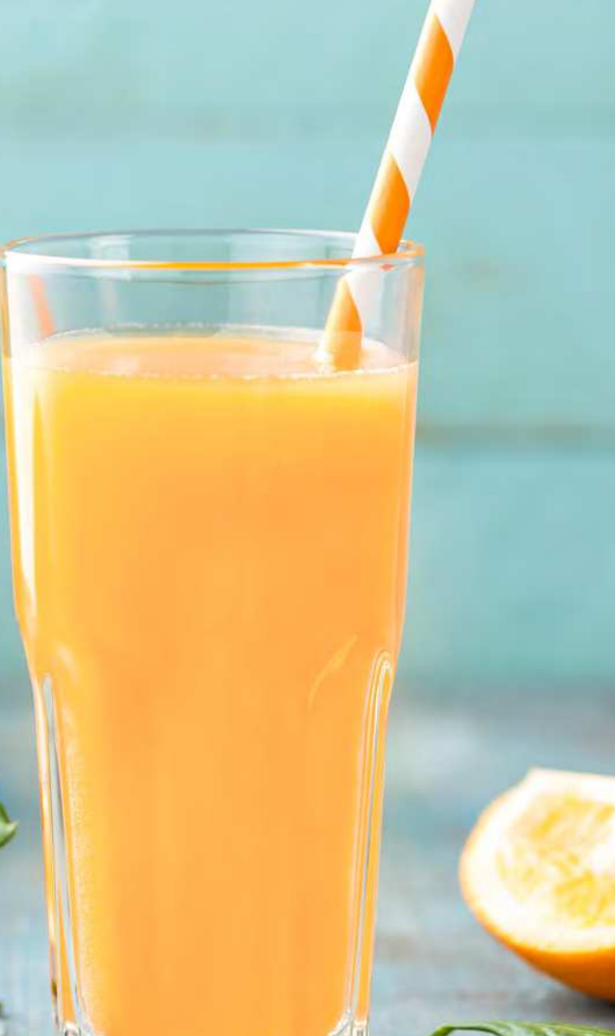
Image used is for illustrative purposes only and does not represent finished recipe.